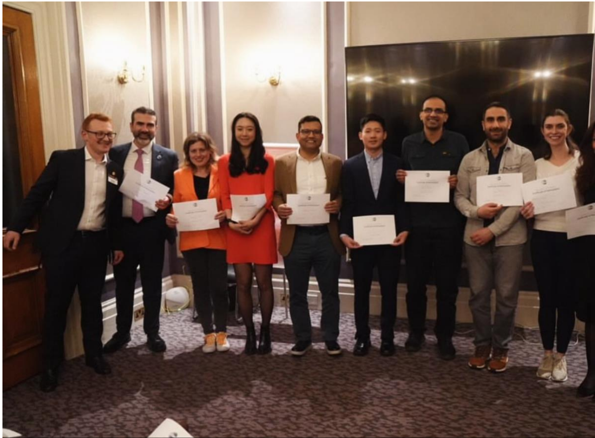
Club Contest Night – Every contestant brought courage and charisma to the stage. Here is to the power of participation and the spirit of Olympians!

From the Ice Breaker to the contest stage, every challenge we take on at London Olympians shapes us into stronger speakers — and stronger people.